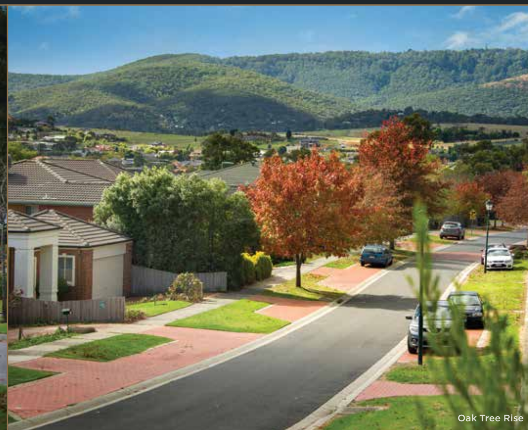
Oak Tree Rise